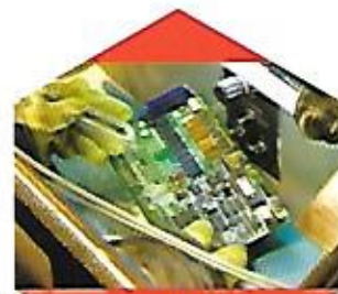
TESTING of PCB